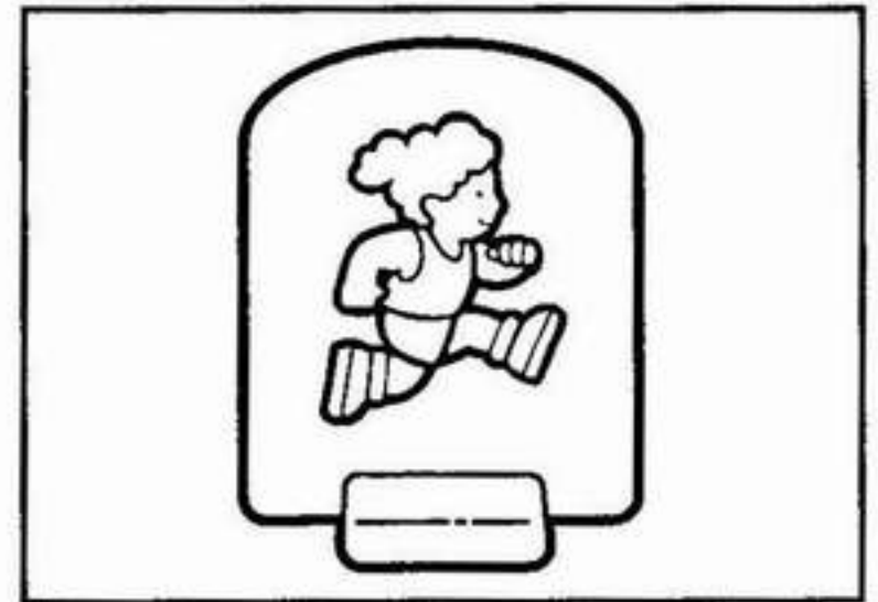
ASSEMBLED GAME PIECE