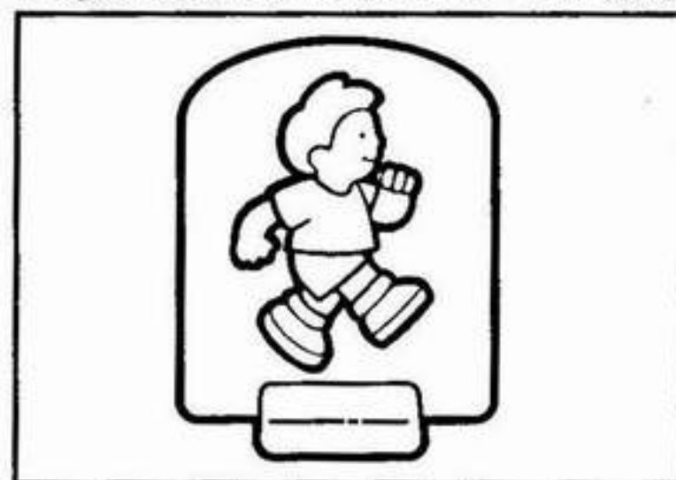
ASSEMBLED GAME PIECE