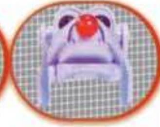
Know it all